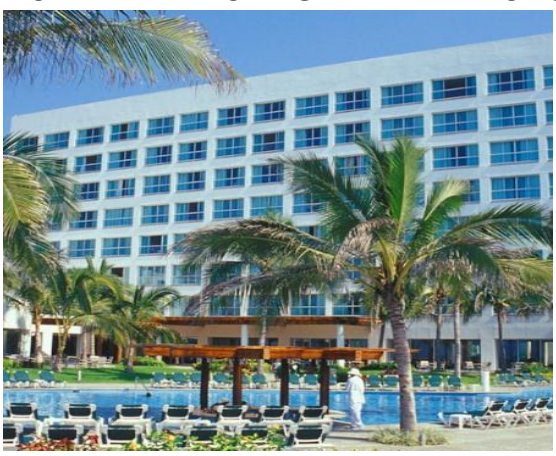
Mayan Palace - Mayan Sea Garden - Acapulco

MAYAN PALACE – MAYAN SEA GARDEN – NEUVO VALLARTA