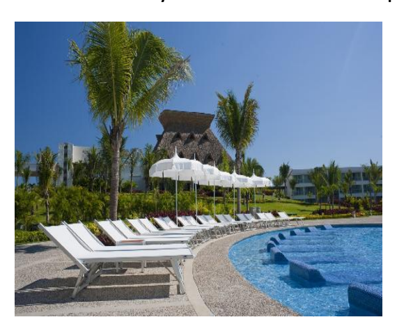
Mayan Palace – Mayan Sea Garden – Mazatlan